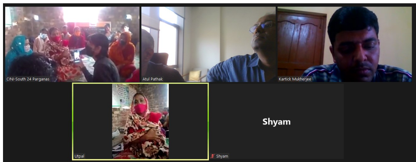
Figure 2: Video interviews with beneficiaries of the Titan Kanya program - IIMPACT

“I feel that all the students who come to the center will study further. If the center were not there, there would have been many problems for these kids. Their parents would have to get them married at an early age. However, this problem has reduced significantly now. The parents have seen the system at the centers, and they are feeling happy about the progress the children are making”